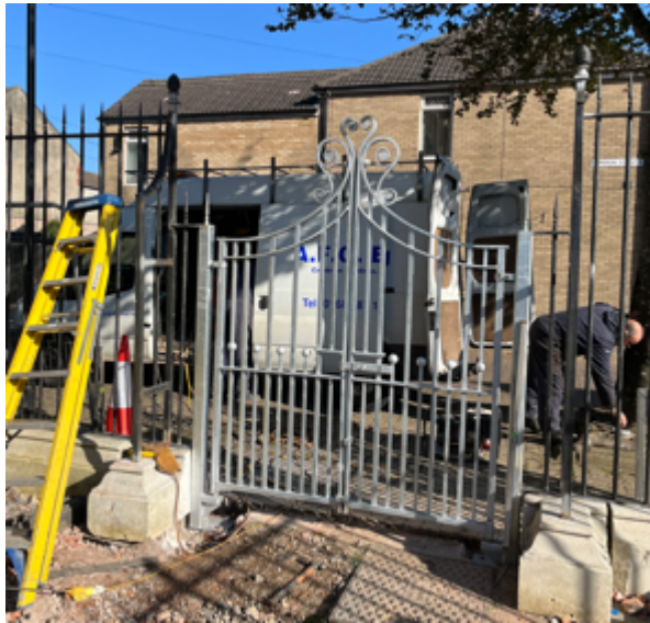
(All they need now is a lick of paint!)