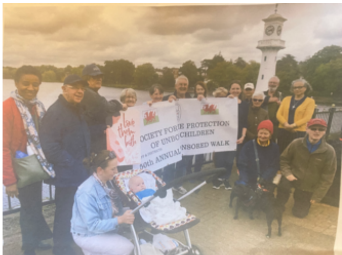
St Alban's Parishioners donated an amazing £617:00 towards the SPUC 50th Sponsored Walk.