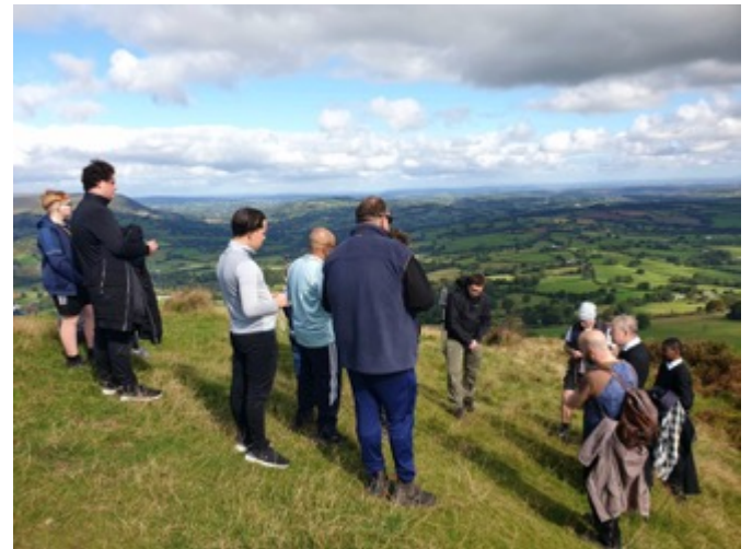
Then praying the Rosary on the site of destroyed St Michael's Chapel on the mountain.