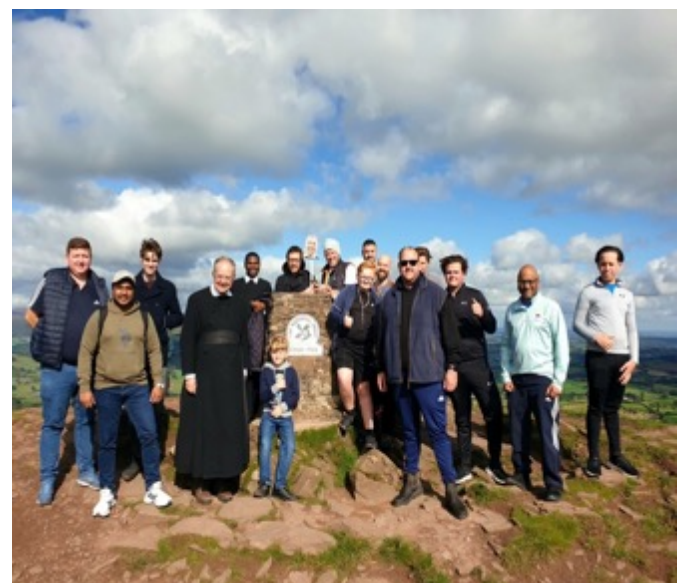
The obligatory photo, to prove we did it!

The Annual Oratory men's pilgrimage went very well. 17 in all turned up for it. After Mass followed by breakfast men, and father with sons, made the hike up the hill. It was a dry day and the views were spectacular as always, being able to see as north as Powys and as far south as the West Country. The holy Rosary was prayed, for all intentions led by